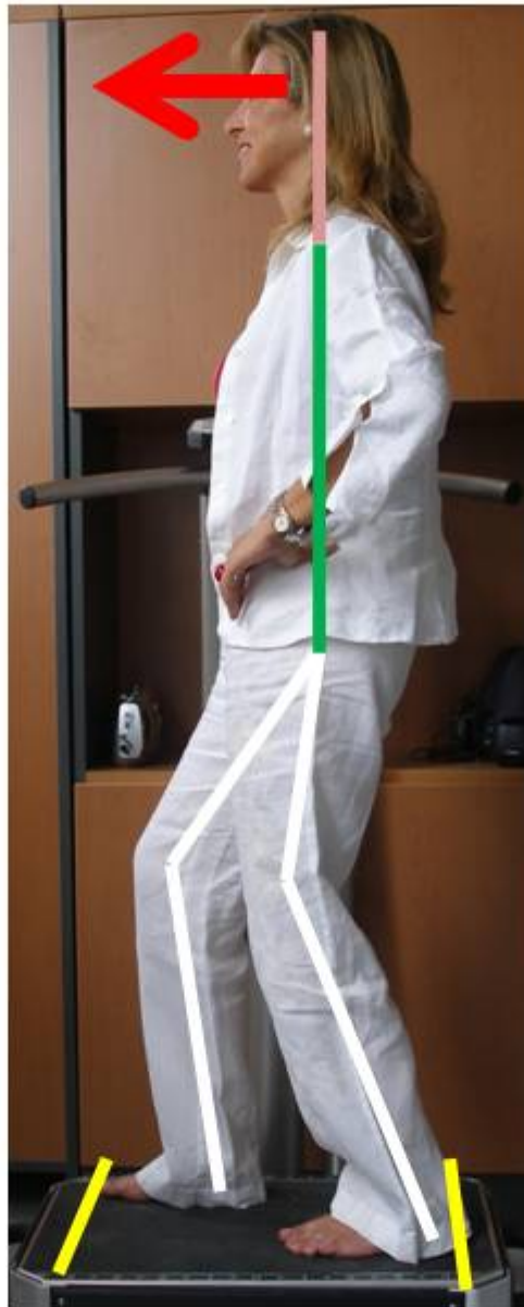
Figure 2. Posture of subjects on the vibratory platform